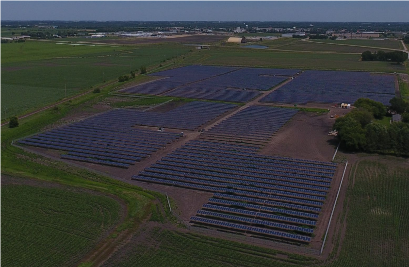
Southern Minnesota Municipal Power Agency's 5 MW Lemond Solar Station Owatonna, MN