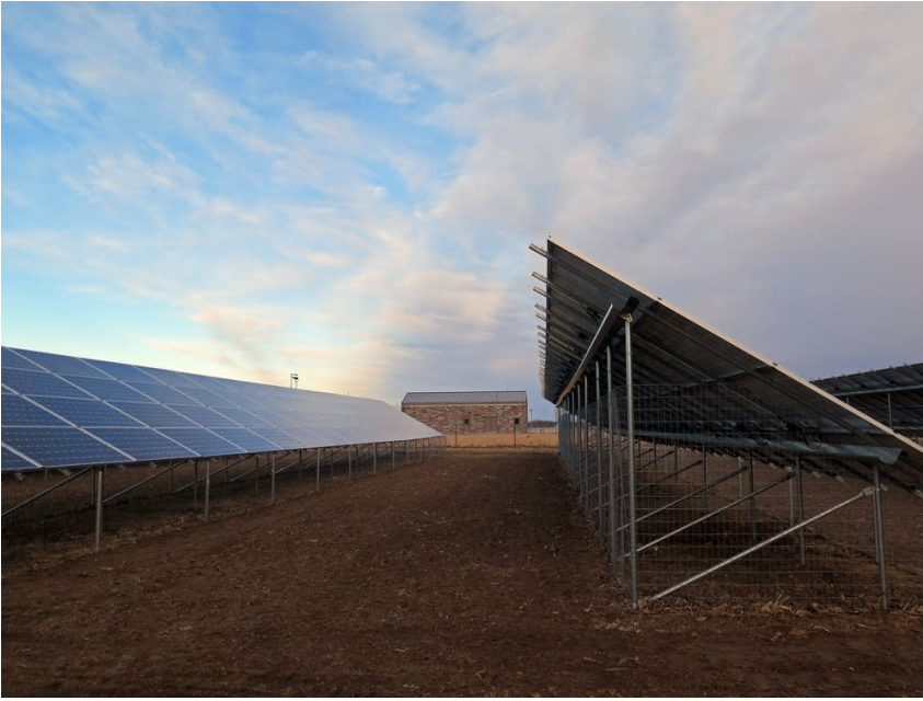
St. Cloud Utility's 220 kW Wastewater Solar Array St. Cloud, MN