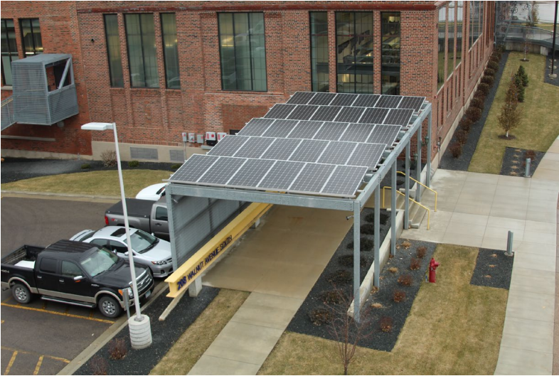
Owatonna Public Utility's 10 kW Demonstration Solar Owatonna, MN