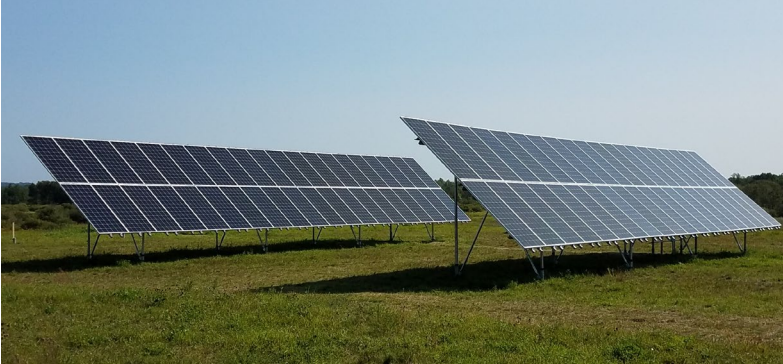
Detroit Lakes Public Utility's 29.3 kW Select Solar Community Solar Garden Detroit Lakes, MN